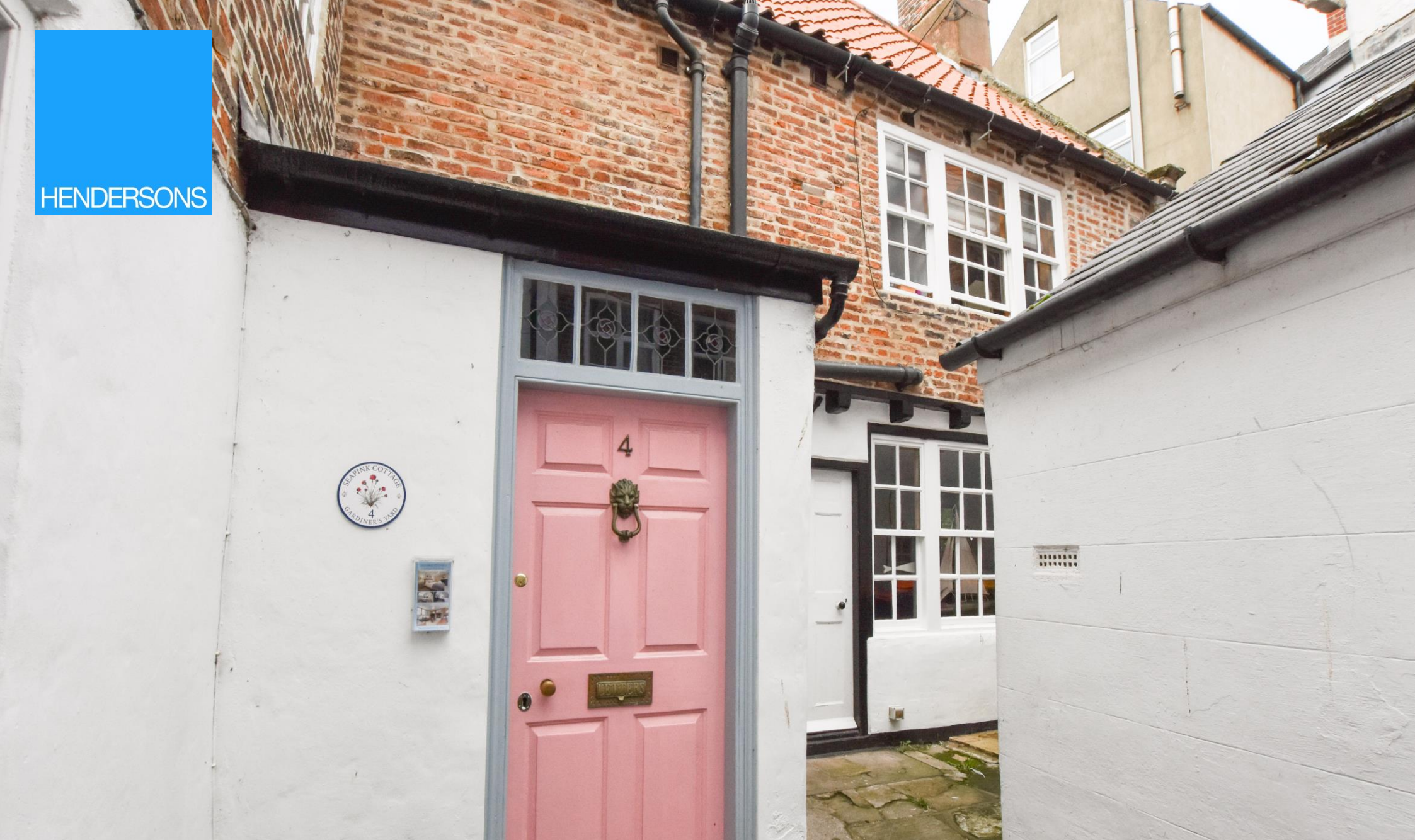
SEA PINK COTTAGE, 4 GARDINERS YARD, WHITBY £425,000